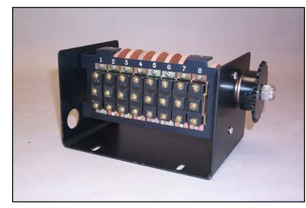
Limit Switch with and without cover