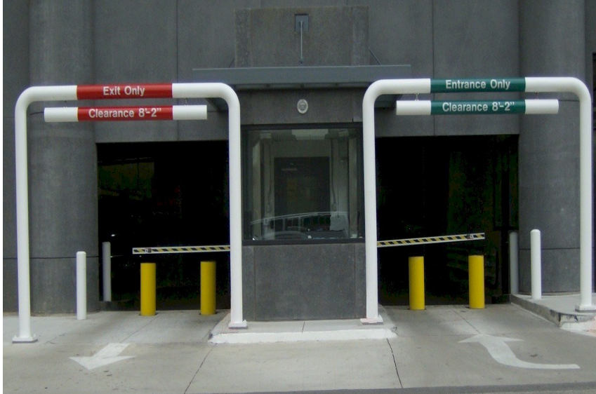
Model B-30 Bollard System

Arranged independently or as a set, the Model B-30 Bollard System incorporates dual speeds. Normal operation, which is site adjustable, and emergency fast operation (less than 1 second) for when immediate deterrence is required. The bollards also feature multiple operating methods including card reader activation, push button control, and vehicle detection to suit the characteristics of any operation.